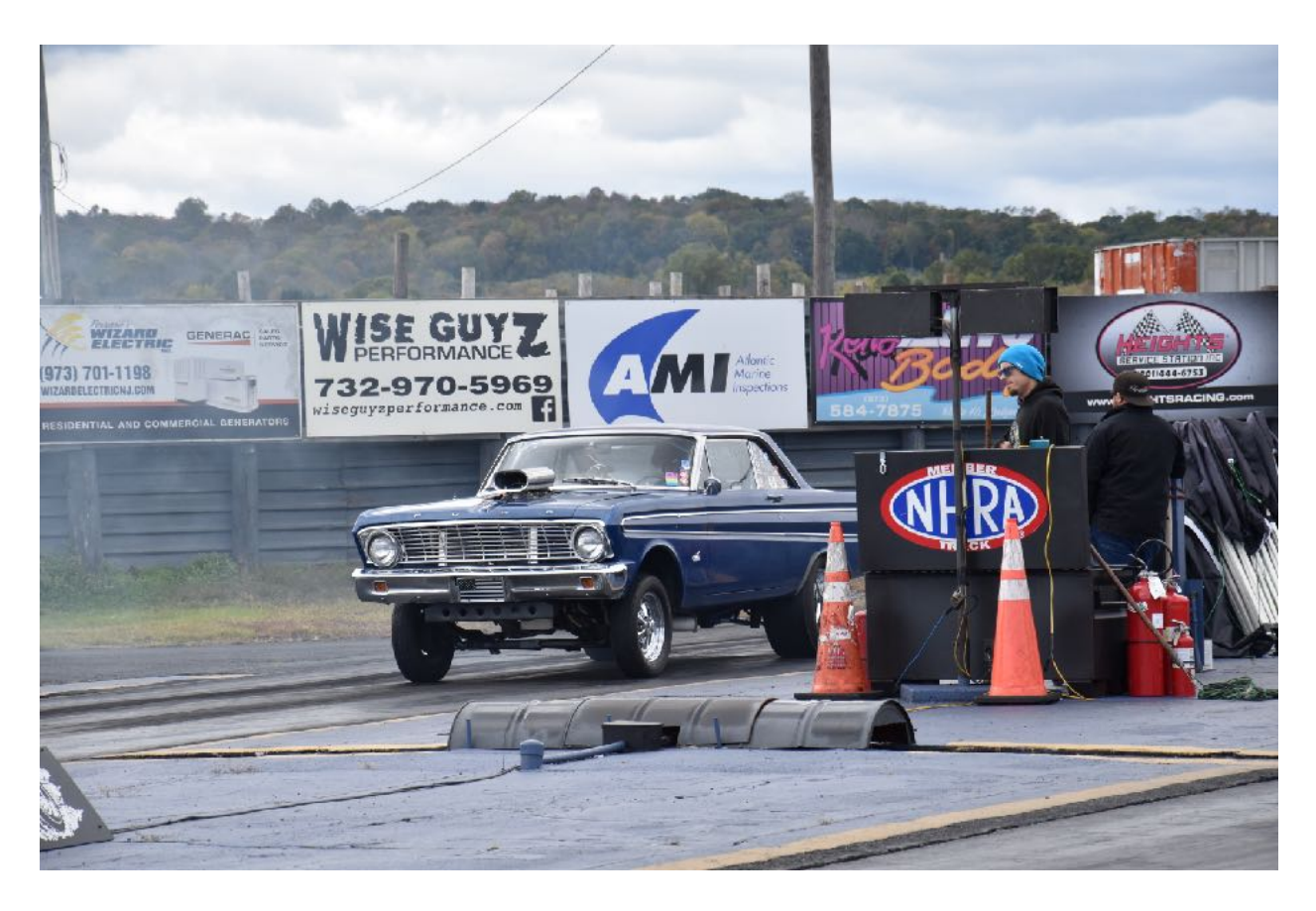
Your 2023 ECG points champion staging for the last time of the season.