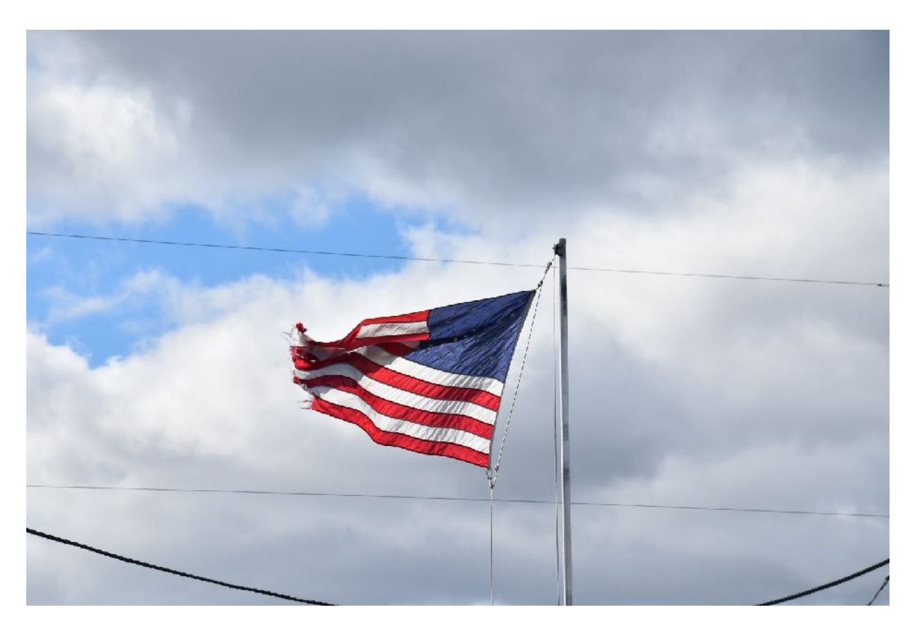
Getting windy and cooler.