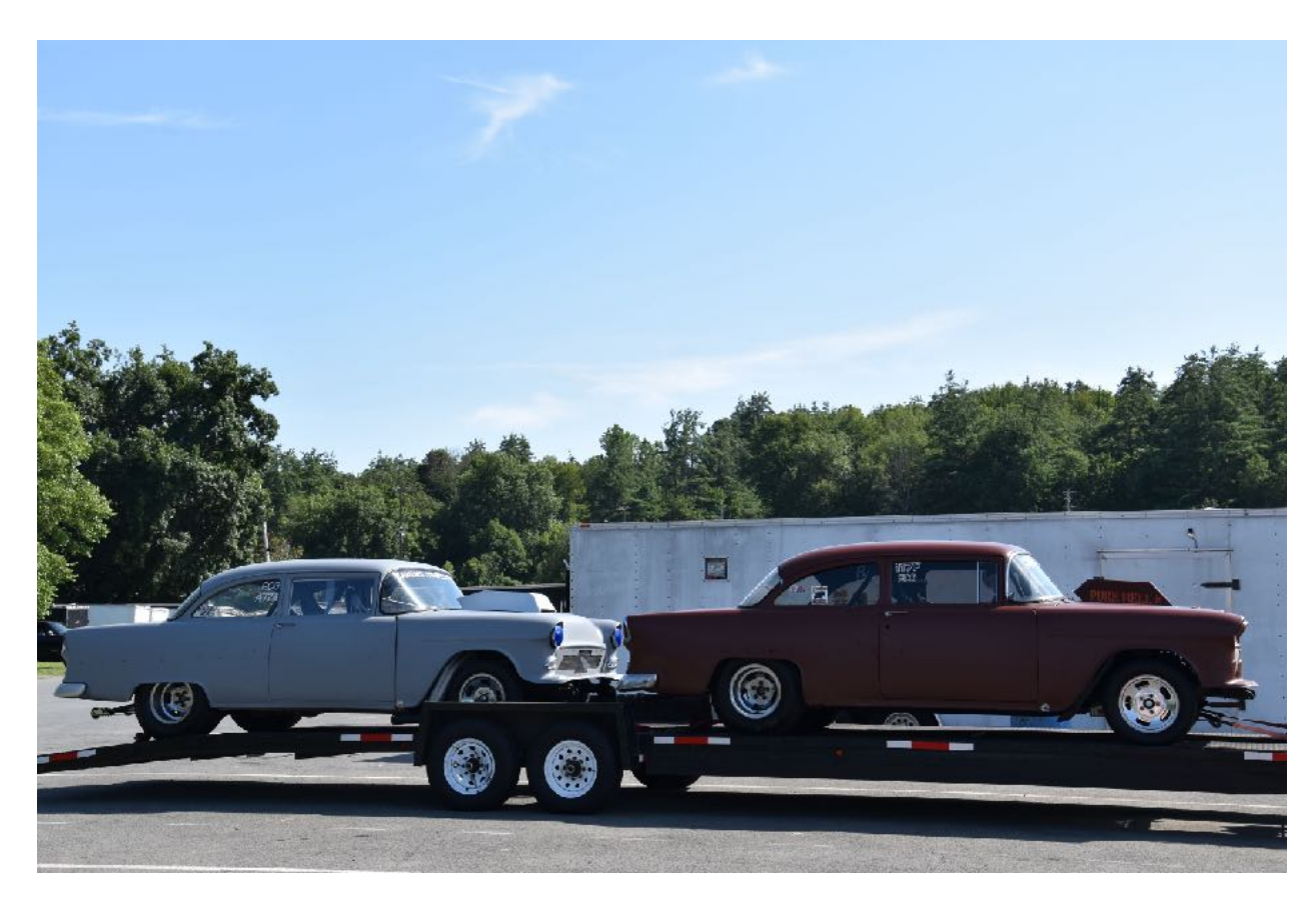
If you like Tri-Five Chevys this rig is "eye candy"